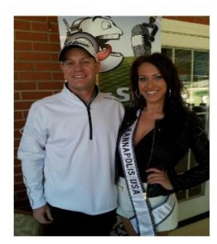
Ms. Kannapolis stops by The Golf Shop during ACC remote broadcast at Irish Creek