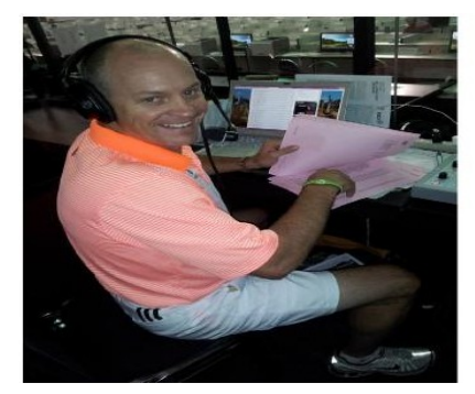
Greeny covering The US Open